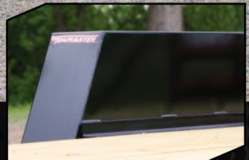
Heavy-duty one-piece formed fender with backing plate keeps tire debris off equipment.