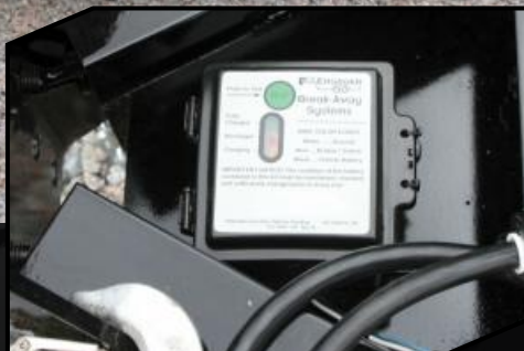
Sealed battery break-away system charges while plugged into the tow vehicle and can be checked at the press of a button.