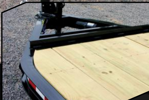
Formed frame and tongue provide a strong and integral structure for the trailer.