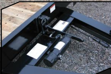
Positive locking (over-center) latch system keeps deck secured to the frame.