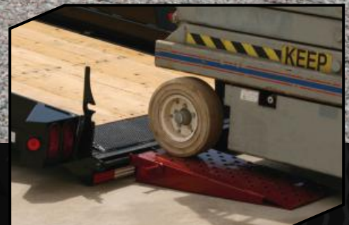
The "SL" (Scissor Lift) option includes ramps to lower the loading incline.