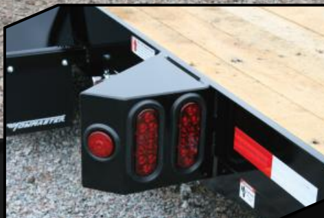
Grommet mounted LED lights are standard.