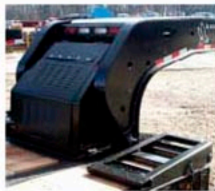
Optional gooseneck light bar and full lockable rear cover.