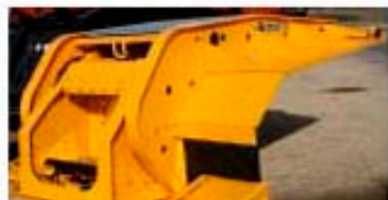
Optional gooseneck storage area and optional gooseneck fenders.