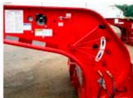
Simple one hand adjustment of deck height and or fifth wheel settings. No doors, shims or spacers.