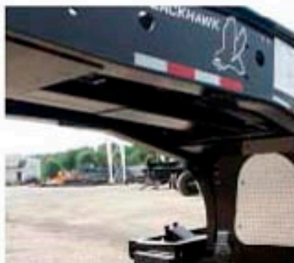
Hydraulically operated gooseneck support arm and gravel guard.