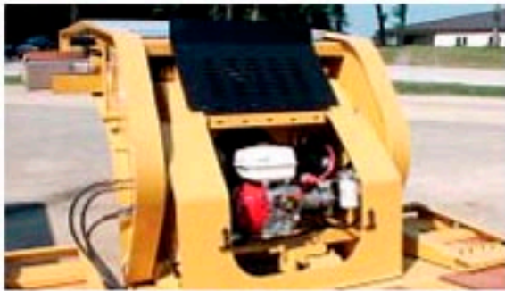
Optional self contained engine package.