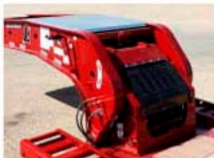
Bolt-on 1/8" aluminum floor plate gooseneck cover.